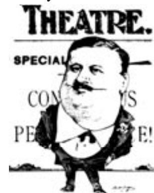
Caricature of Pastor