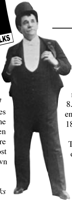
Tony Pastor, showman

Most Elks know their order was originally a drinking club called the Jolly Corks, founded in New York in 1867 by the English comic singer Charles Vivian. Some Elks even know the names and occupations of the fifteen “original Jolly Corks.” But there was a common denominator for most of these performers that is less known today: Tony Pastor.